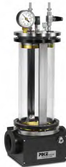
Variable-Path Gas Cell

For optimal performance the mirrors have been diamond turned and coated with the highest quality gold for maximum reflectivity and inertness. The accessory mirrors are mounted permanently with mechanical mirror mounts to eliminate out-gassing chemicals that may occur when using epoxies to secure the mirrors. Windows are easily replaceable and a variety of window materials are available.