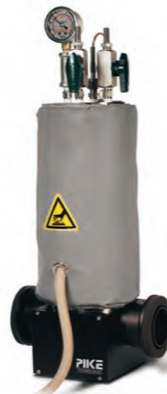
5-m Heated Gas Cell